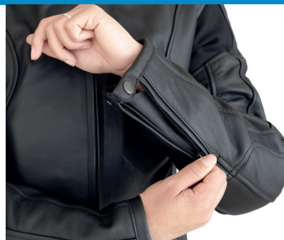
Zippers on the sleeves