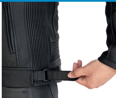
Perfect fit with velcro and stretchy leather