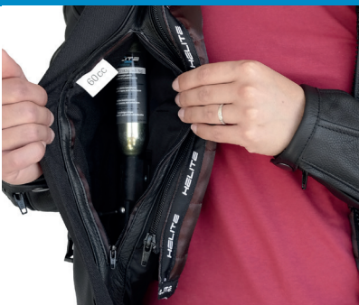
Hidden cartridge in a pocket